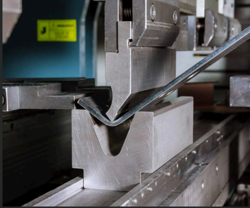
PLATE SUPPLY - CUTTING - LASER/PLASMA - ROLLING - BENDING